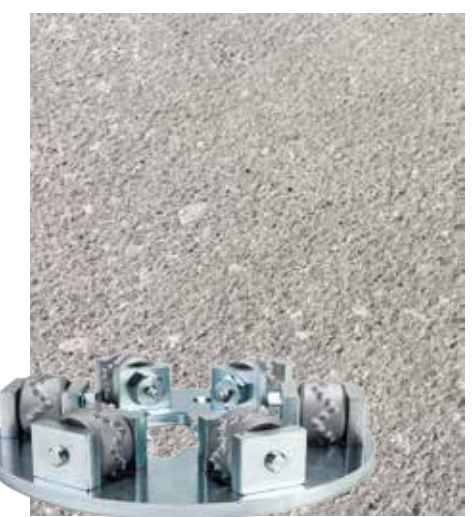
Profile of concrete after one pass with the HTC Ravager ^{\text{\tiny{TM}}}

HTC Ravager<sup>™</sup> tools can also achieve a standard surface preparation profile equivalent to International Concrete Repair Institute's (I.C.R.I.) Concrete Surface Profile (C.S.P.) standard of 6-7 using your HTC grinder.