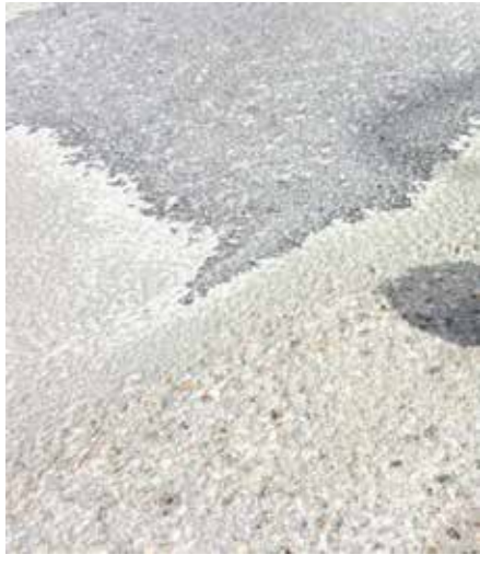
The remnants of a 10mm overlay after three passes with the HTC Ravager™